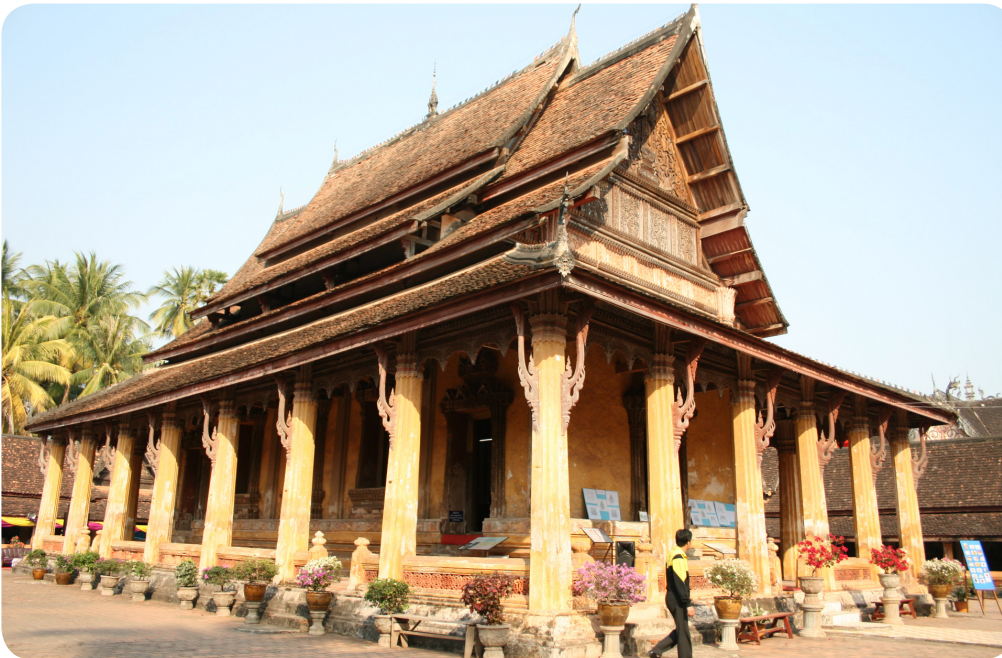
Vat Sisaket's historic sim (central hall) contains a large golden sitting buddha.