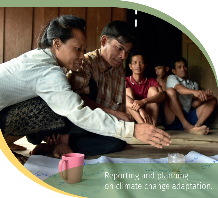
Reporting and planning on climate change adaptation.