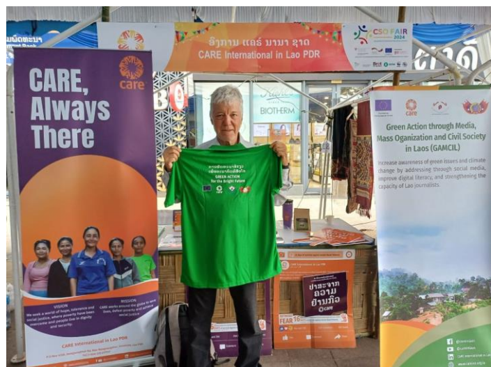
Exhibition of Achievements and Products at the National CSO Fair 2024