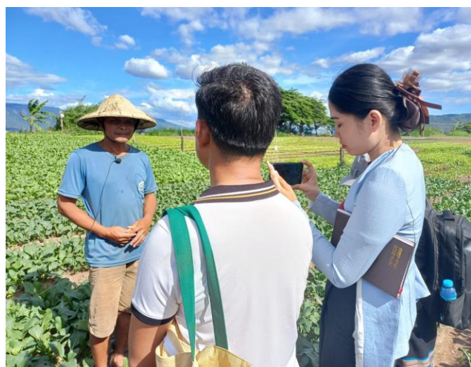
Training workshop for Lao journalists nationwide

In this training, Lao journalists practiced and learned about reporting in a new, concise but comprehensive format, reporting on green news, finding reliable sources, writing stories about green issues, taking interesting photos, using the Canva application