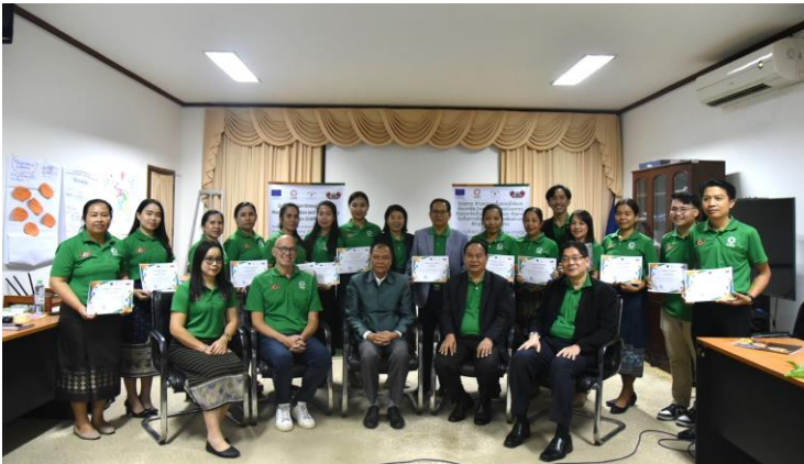
The Training of Trainer Workshop "Green Issues Reporting for Lao Journalists