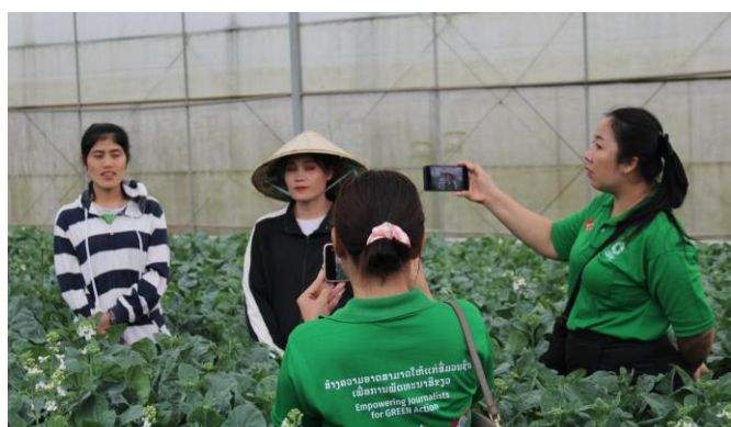
Training Workshop on Green Reporting for Lao journalists from the Southern part of Laos