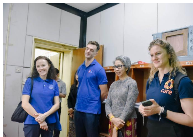
GAMCIL Project welcomed a delegation from the European Union to Luang Prabang province