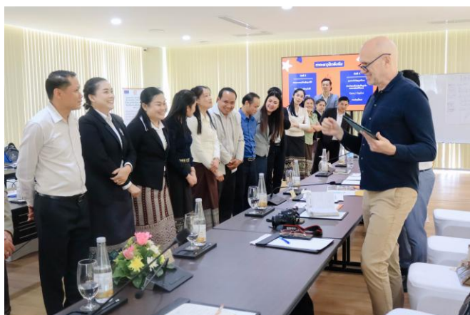
Annual two-week training on Green Reporting for Lao journalists from the northern part of Laos