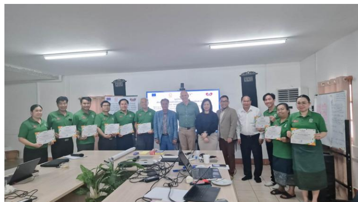
Training on Management of Self-Learning Course for Team and Partners