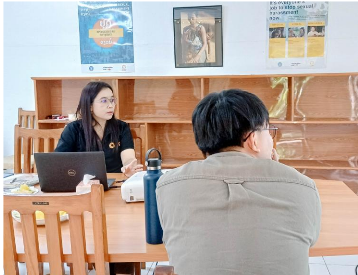
GAMCIL project met with the project coordinator from the Lao Civil Society Organizations